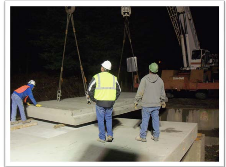
Superstructure replacement in Harlan Co., KY completed within 8 hours.